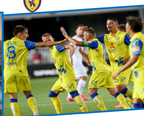
AC Chievo Verona