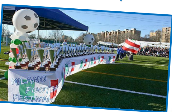
Milan Soccer Festival