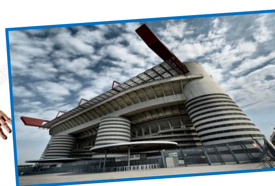
San Siro Stadium