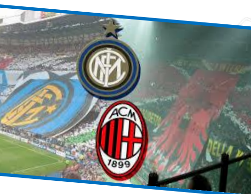
San Siro Live Game